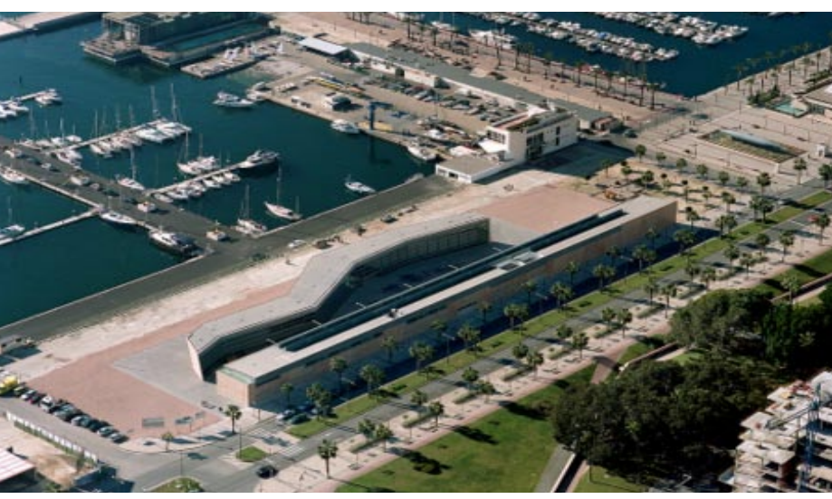
Aerial view of the museum

underwater pieces of the Spanish subaquatic cultural heritage. It is outfitted with the latest interactive video and display technology to enable visitors to get a real feeling for the museum's absorbing contents and the environment they come from.