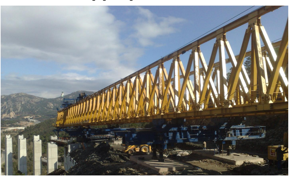
Construction work at one of the viaducts

between 156 and 580 metres and five tunnels dug from the inside out, from 197 to 1,850 metres in length.