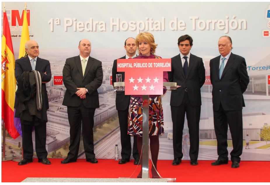
Madrid President Esperanza Aguirre at the cornerstone-laying ceremony

million euro. The centre incorporates criteria of sustainability, which means it uses renewable energy and bioclimatic architecture. It will also have electronic clinical records and digital radiography.