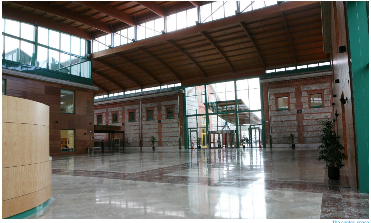
The central space

Both facilities are located in a former tobacco warehouse