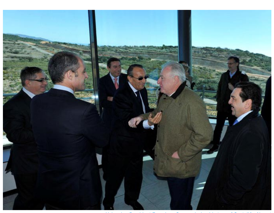
Valencian President Francisco Camps during his tour of Castellón Airport

The 68,000-m<sup>2</sup> parking apron can a two-storey, 9,000-m<sup>2</sup> building, has twelve check-in desks, four boarding gates and two baggage carousels.